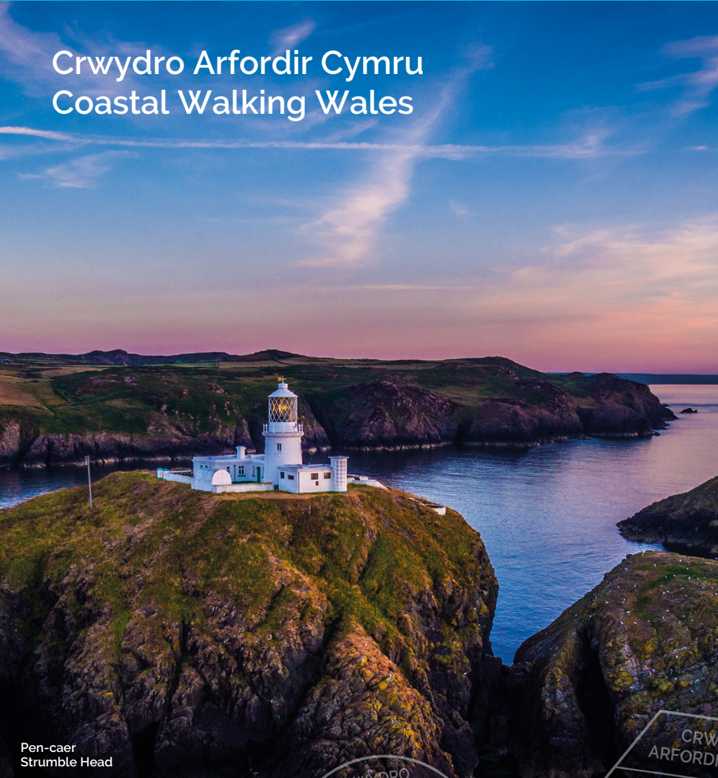
Pen-caer Strumble Head